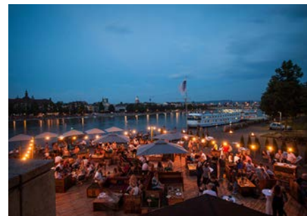
SDC-Networking Apéro 7 June, 17:15, RhyPark