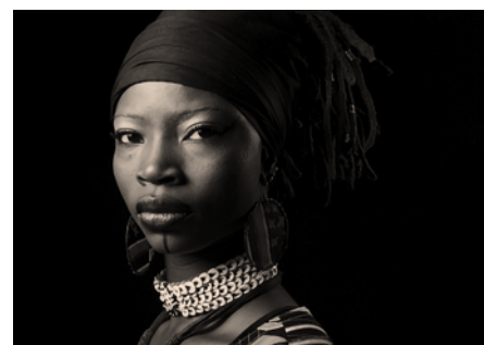
Celebration of the 40th IAMANEH anniversary with singer and dancer from the Ivory Coast, Dobet Gnahoré 8 June, 20:15, Parterre One Music