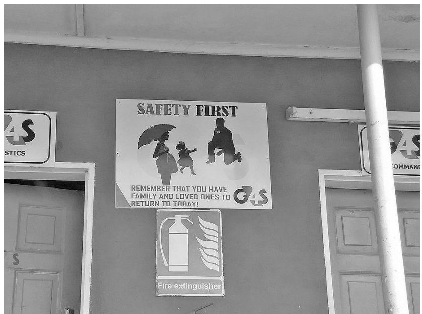
Mining companies externalize security issues to its labour force. First Quantum Minerals, Solwezi, Zambia.

Besides debt, many miners in Zambia agree that with a government and union that is unable to regulate the labour market, subcontracting is the future of work in Zambia's mining sector. This is because the new mining companies run a profit driven production system with retrenchment of workers as the first response to commodity price volatility, and subcontracting is their main way of reducing production costs. As one miner lamented: "When we will lose our jobs, if we are lucky we will get a job as a contractor. I think that going forward all jobs in the mine will be sub-contracted. These days, when I go home from work, my wife and even children ask me if I still have a job. Losing a job is so common that people are almost always expect it."