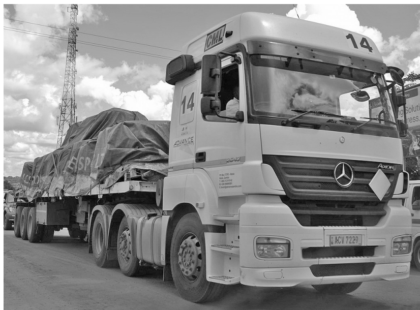
Swiss companies are not only major players in the copper trade but also make profits in its transport (picture: Rita Kesselring 2015).

The examples described here do not, by any means, cover all areas in which Swiss companies are important