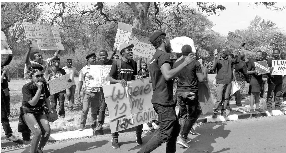
Demonstration during the budget speech of the Minister of Finance. Lusaka 28 September 2018.

airports. The cost of living has risen dramatically and the population is suffering as a result. Drastic cuts in spending on health, education and other public services increase social inequality, already very high in Zambia (ranking fourth in the worldwide index for inequality). Students have already protested, and other social protests could follow.