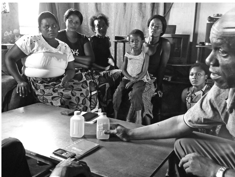
A sample of “drinking water” in Kankoyo, Mufulira, presented during a site-visit of the Swiss ADR Campaign.

“Those who can, move away from here,” said our partners from the town of Mufulira in the Zambian Copperbelt. The Mopani copper mine has been majority-owned by Glencore since the Zambian mines were privatized at the beginning of the 2000s. Many hoped for an improvement in living conditions, but this did not happen. The house façades peel off due to the acid rain, the air causes breathing problems, and many jobs in the mine have disappeared. And then there is the “drinking water”: with visible residue, which nobody drinks before having first boiled it. Since they cannot move away, the residents of the neighbourhoods Butondo, Kankoyo and Kantanshi around the mine Mopani want access to clean water.